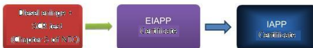
Figure 7.2.1 Certification process of Scheme A

7.2.1 Certification process of Scheme A is shown in Figure 7.2.1.